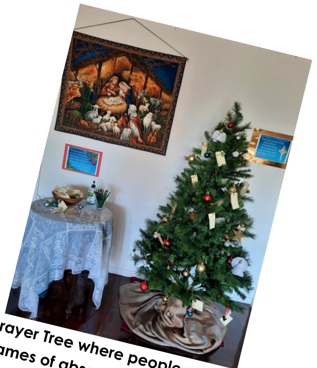
Prayer Tree where people write the names of absent friends and or family to be lifted in prayer.