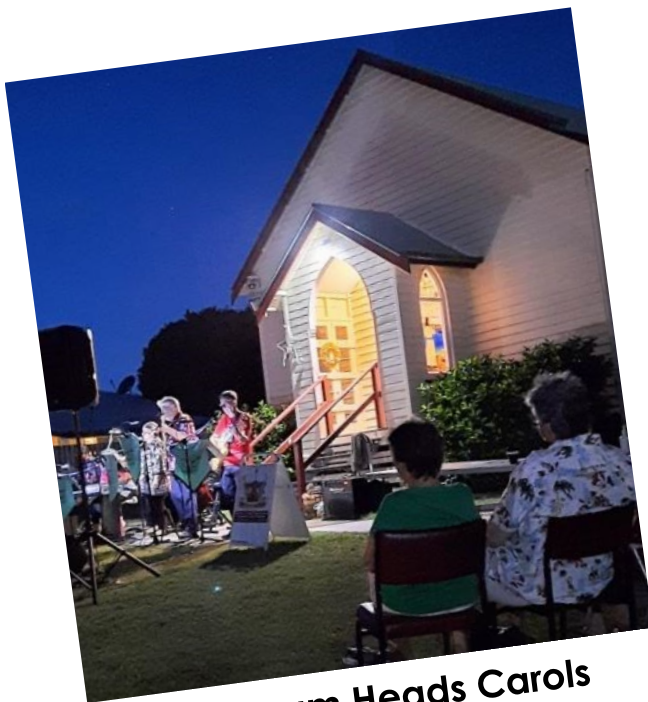
Burrum Heads Carols

Peter said to them, “Each one of you must turn away from your sins and be baptized in the name of Jesus Christ, so that your sins will be forgiven; and you will receive God's gift, the Holy Spirit. Acts 2:38 GNT